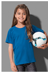
ST8570 Active 140 Raglan Kids